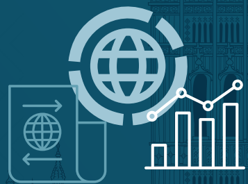
Department for Business and Trade (DBT)